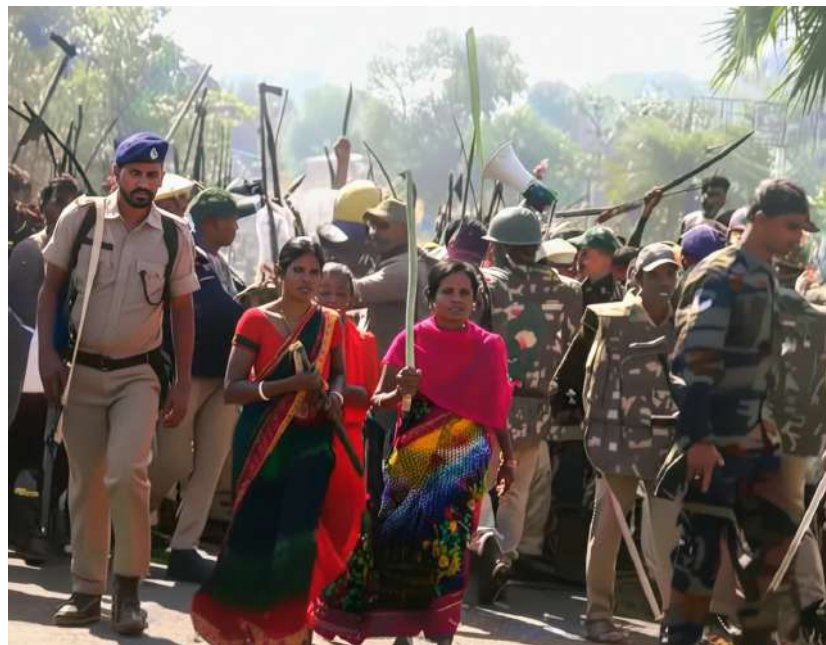
Palpable tension continues to simmer in Malkangiri; Odisha govt intervenes after